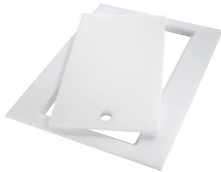
HDPE Twin chopping board 8644 101

* only in combination with the accessory 8644 101