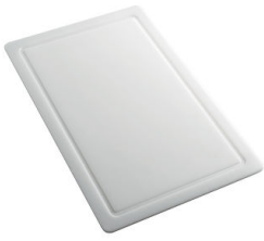
HDPE Chopping board 8657 001