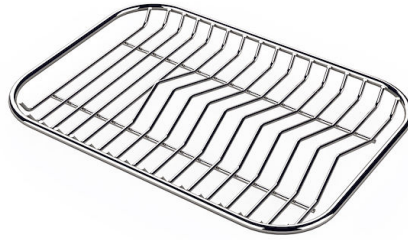
Stainless steel plate rack only usable in combination with the accessories 8644 003 8100 154