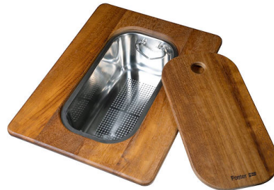
Iroko-wood sliding chopping board with stainless steel colander 8644 044